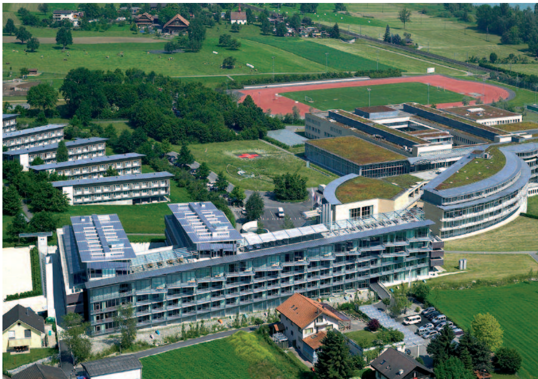
Paraplegic and quadriplegic patients come from all over Europe for care at The Swiss Paraplegic Center, Nottwil.

On average, almost 800 patients are receiving some type of treatment at the center on any given day. Much of this treatment is in the form of care for the decubitus ulcers, genitourinary infections and incontinence, respiratory complications, and neuropath-